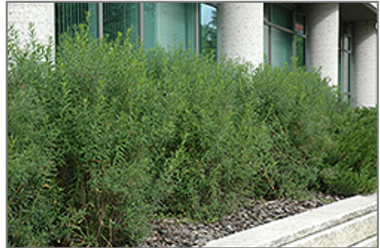
Dwarf Turkestan Burning Bush