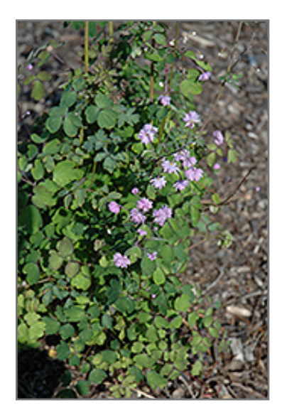
Hewitt's Double Meadow Rue in bloom