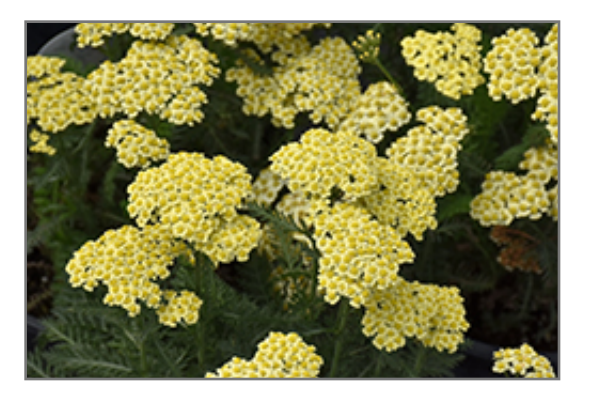
Sunny Seduction Yarrow flowers

A compact and hardy perennial with pretty lemon yellow flowers that mature to buttery yellow; excellent for naturalized areas and adaptable to sunny, dry sites