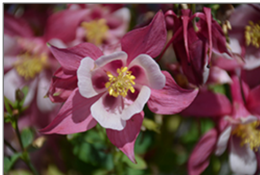
Origami Rose and White Columbine flowers

Origami Rose and White Columbine is recommended for the following landscape applications;