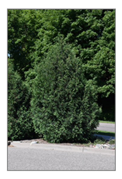
Techny Arborvitae