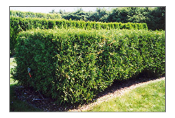
Techny Arborvitae