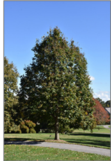
Redmond Linden

Redmond Linden is recommended for the following landscape applications;