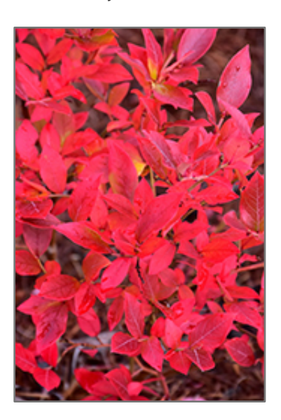
Chippewa Blueberry in fall