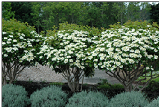
Compact European Cranberry in bloom

Compact European Cranberry is a dense multi-stemmed deciduous shrub with a more or less rounded form. Its average texture blends into the landscape, but can be balanced by one or two finer or coarser trees or shrubs for an effective composition.