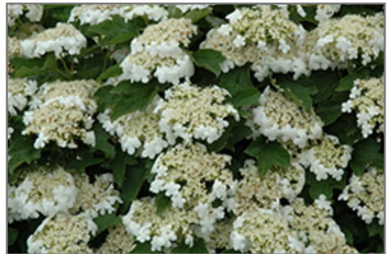
Compact European Cranberry flowers