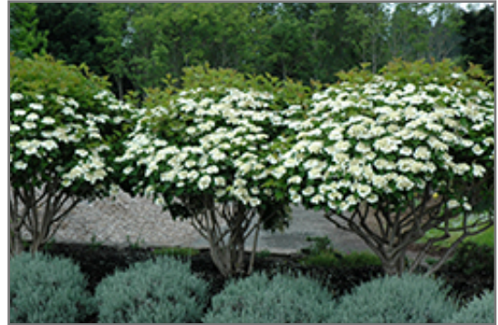
Compact European Cranberry in bloom

Compact European Cranberry is a dense multi-stemmed deciduous shrub with a more or less rounded form. Its average texture blends into the landscape, but can be balanced by one or two finer or coarser trees or shrubs for an effective composition.