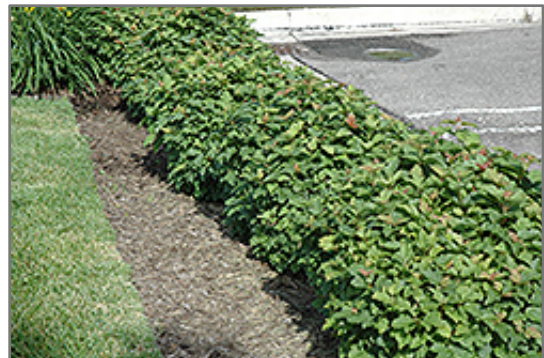
Dwarf European Cranberry