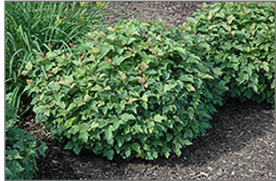
Dwarf European Cranberry