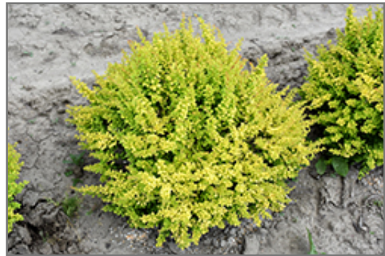
Sunsation Japanese Barberry

Sunsation Japanese Barberry is recommended for the following landscape applications;