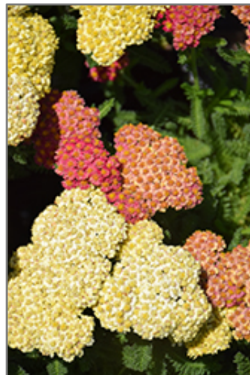
Desert Eve Terracotta Yarrow flowers