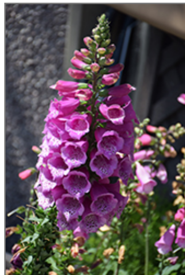
Dalmatian Purple Foxglove flowers

Dalmatian Purple Foxglove is recommended for the following landscape applications;