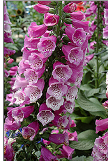
Dalmatian Purple Foxglove flowers