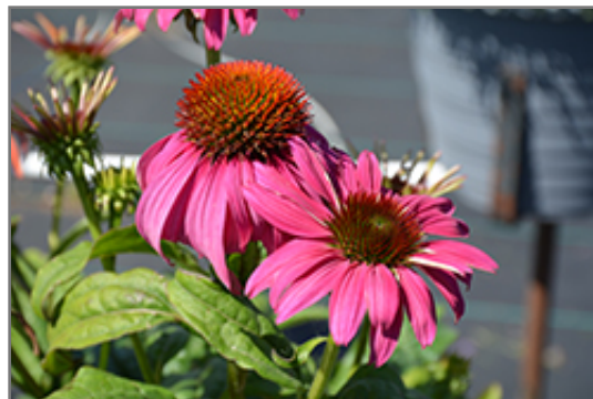
Cheyenne Spirit Coneflower flowers

Cheyenne Spirit Coneflower will grow to be about 16 inches tall at maturity extending to 24 inches tall with the flowers, with a spread of 18 inches. Its foliage tends to remain dense right to the ground, not requiring facer plants in front. It grows at a medium rate, and under ideal conditions can be expected to live for approximately 10 years. As an herbaceous perennial, this plant will usually die back to the crown each winter, and will regrow from the base each spring. Be careful not to disturb the crown in late winter when it may not be readily seen!