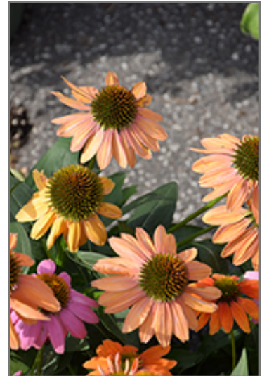
Cheyenne Spirit Coneflower flowers