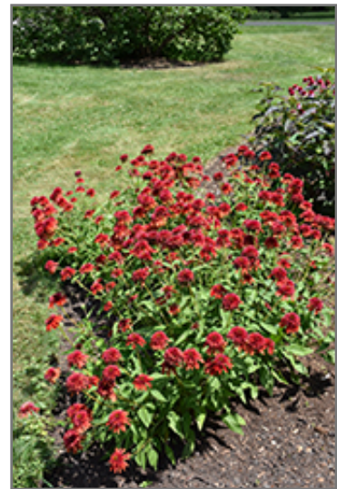
Double Scoop Orangeberry Coneflower in bloom