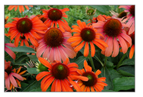
Julia Coneflower flowers