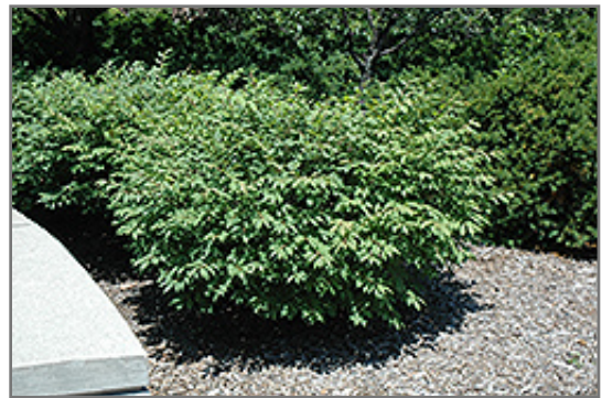
Fire Ball Burning Bush