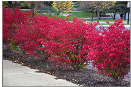
Fire Ball Burning Bush in fall

Fire Ball Burning Bush is recommended for the following landscape applications;