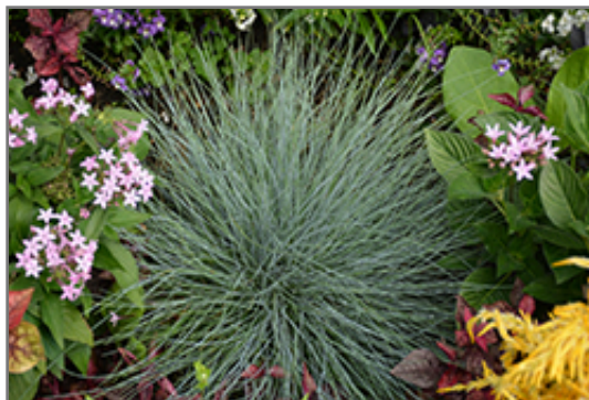
Beyond Blue Blue Fescue

This plant does best in full sun to partial shade. It prefers to grow in average to dry locations, and dislikes excessive moisture. It is considered to be drought-tolerant, and thus makes an ideal choice for a low-water garden or xeriscape application. It is not particular as to soil type or pH. It is highly tolerant of urban pollution and will even thrive in inner city environments. This is a selected variety of a species not originally from North America. It can be propagated by division; however, as a cultivated variety, be aware that it may be subject to certain restrictions or prohibitions on propagation.