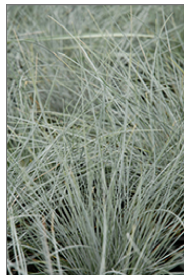
Beyond Blue Blue Fescue foliage