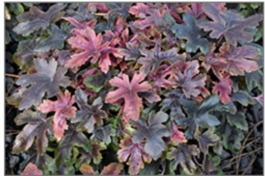
Brass Lantern Foamy Bells

Brass Lantern Foamy Bells is recommended for the following landscape applications;