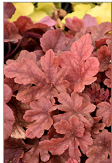
Buttered Rum Foamy Bells foliage