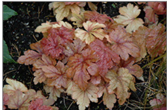
Buttered Rum Foamy Bells

Buttered Rum Foamy Bells is recommended for the following landscape applications;