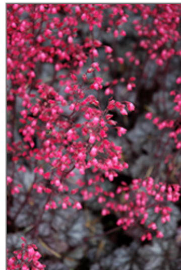
Glitter Coral Bells flowers

Glitter Coral Bells will grow to be about 10 inches tall at maturity extending to 16 inches tall with the flowers, with a spread of 14 inches. When grown in masses or used as a bedding plant, individual plants should be spaced approximately 12 inches apart. Its foliage tends to remain low and dense right to the ground. It grows at a medium rate, and under ideal conditions can be expected to live for approximately 10 years. As an evergreen perennial, this plant will typically keep its form and foliage year-round.