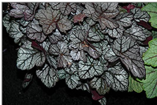
Glitter Coral Bells foliage