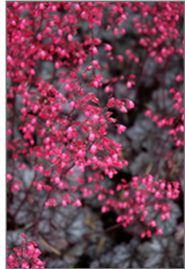
Glitter Coral Bells flowers

Glitter Coral Bells is a fine choice for the garden, but it is also a good selection for planting in outdoor pots and containers. It is often used as a 'filler' in the 'spiller-thriller-filler' container combination, providing a mass of flowers and foliage against which the larger thriller plants stand out. Note that when growing plants in outdoor containers and baskets, they may require more frequent waterings than they would in the yard or garden. Be aware that in our climate, most plants cannot be expected to survive the winter if left in containers outdoors, and this plant is no exception. Contact our experts for more information on how to protect it over the winter months.