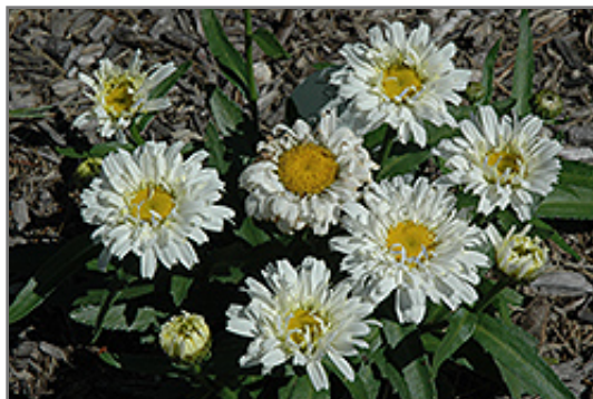
Freak! Shasta Daisy flowers