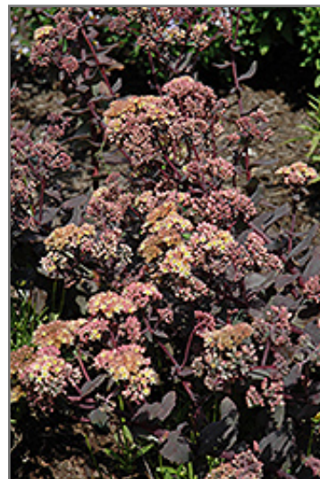
Yellow Xenox Stonecrop flowers

Yellow Xenox Stonecrop is recommended for the following landscape applications;