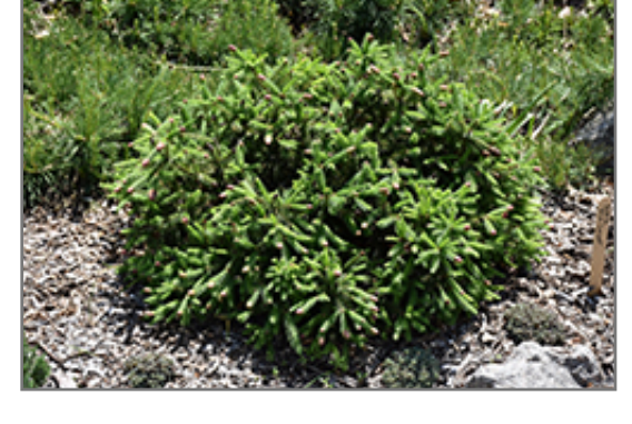
Pusch Spruce

A slow-growing dwarf conifer with lime green new growth that matures to deep green; distinctive red cones in spring mature to brown and persist to the next year; adaptable and hardy