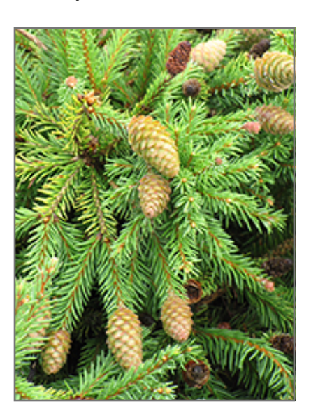
Pusch Spruce foliage