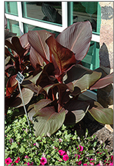
Tropicanna Black Canna

This plant is native to the tropics and prefers growing in moist environments with evenly warm conditions all year round. In our climate, it is usually grown as an outdoor annual in the garden or in a container. If you want it to survive the winter, it can be brought in to the house and provided with special care, and then returned to the garden the following season. In its preferred tropical habitat, it can grow to be around 5 feet tall at maturity, with a spread of 24 inches. However, when grown as an annual or when overwintered indoors, it can be expected to perform differently, and its exact height and spread will depend on many factors; you may wish to consult with our experts as to how it might perform in your specific application and growing conditions.