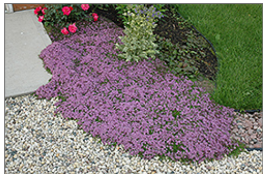
Red Creeping Thyme in bloom