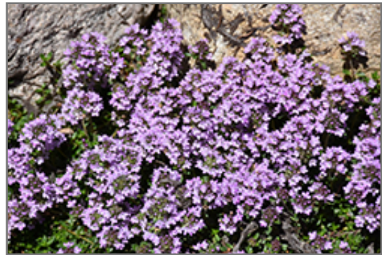
Purple Carpet Creeping Thyme flowers