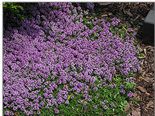
Purple Carpet Creeping Thyme in bloom