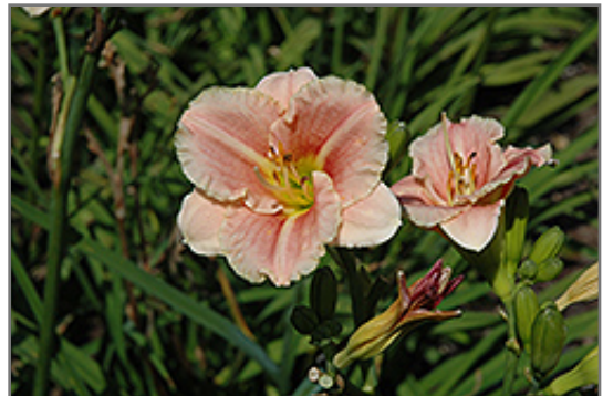
Little Anna Rosa Daylily flowers