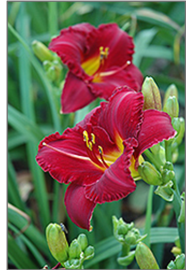
Pygmy Prince Daylily flowers