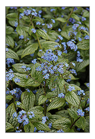
Silver Heart Bugloss flowers

Attractive, large heart shaped leaves are green veined, with silver overlay; clusters of tiny blue flowers in spring; best in moist, rich, well drained soil