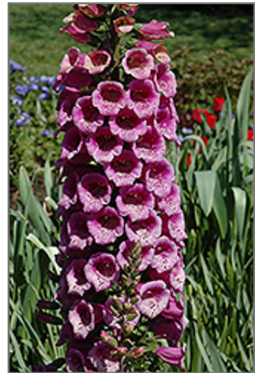
Excelsior Purple Foxglove flowers

Elegant purple-pink tubular flowers with white interiors and dark purple spots; tall spikes rise above attractive green lance-shaped leaves; a biennial that's happiest in part shade with adequate moisture