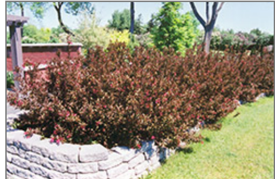
Wine and Roses Weigela