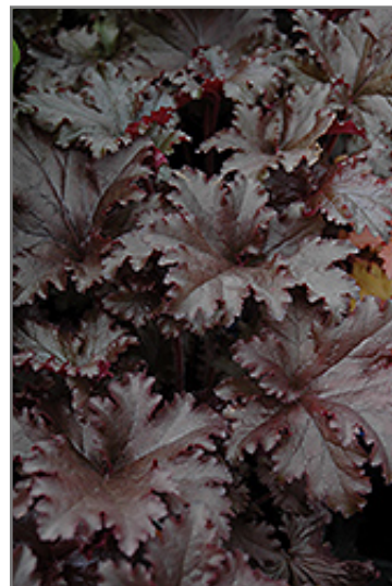
Black Taffeta Coral Bells foliage

Black Taffeta Coral Bells is recommended for the following landscape applications;