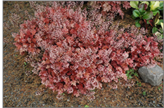
Peach Crisp Coral Bells in bloom

This is a relatively low maintenance plant, and should be cut back in late fall in preparation for winter. It is a good choice for attracting hummingbirds to your yard. It has no significant negative characteristics.