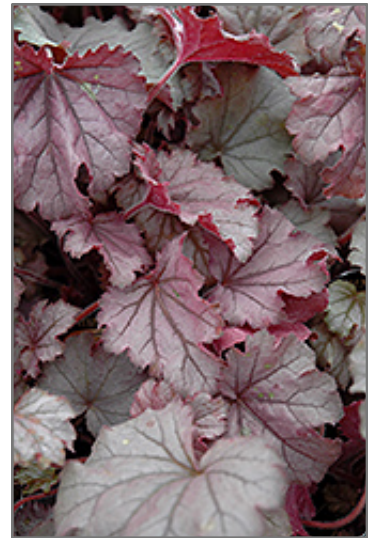
Little Cuties Sugar Berry Coral Bells foliage

Little Cuties Sugar Berry Coral Bells is recommended for the following landscape applications;