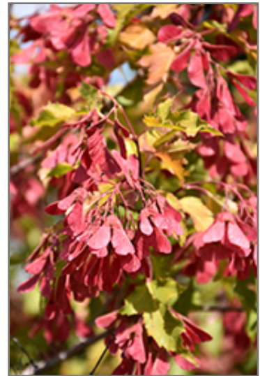
Amur Maple (tree form) fruit

This tree does best in full sun to partial shade. It is very adaptable to both dry and moist locations, and should do just fine under average home landscape conditions. It is not particular as to soil type or pH. It is highly tolerant of urban pollution and will even thrive in inner city environments. This is a selected variety of a species not originally from North America.