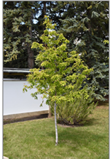
Amur Maple (tree form)