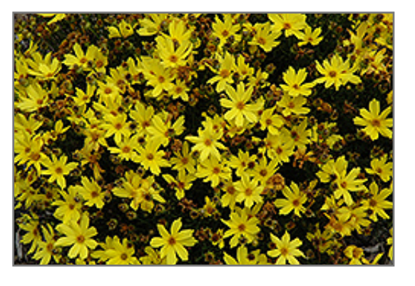
Citrine Tickseed flowers

A dense, low spreading variety, covered with stunning, daisy-like yellow flowers with golden centers; tolerant of pests and drier soils; thriving in sandy and rocky soils; great as edging, or in containers; needs good drainage