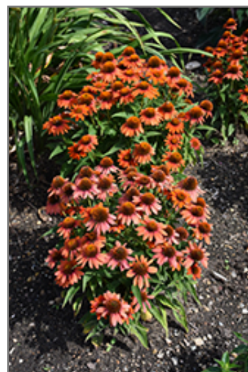
Sombrero Adobe Orange Coneflower in bloom