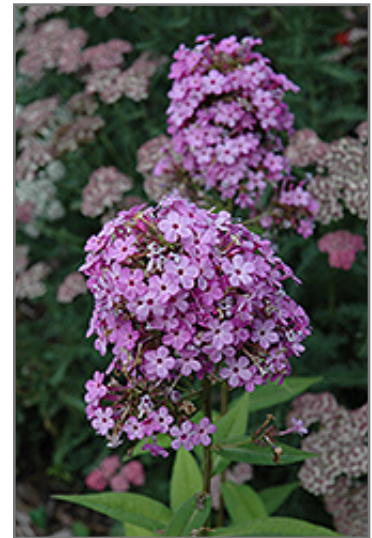
Jeana Garden Phlox flowers

Jeana Garden Phlox is recommended for the following landscape applications;