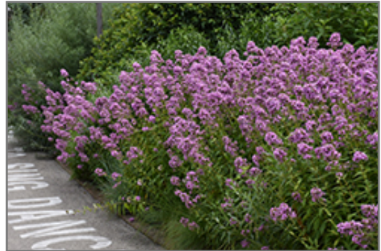
Jeana Garden Phlox in bloom