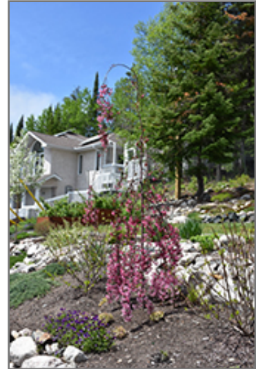
Royal Beauty Flowering Crab in bloom

This shrub should only be grown in full sunlight. It prefers to grow in average to moist conditions, and shouldn't be allowed to dry out. It is not particular as to soil type or pH. It is highly tolerant of urban pollution and will even thrive in inner city environments. This particular variety is an interspecific hybrid.