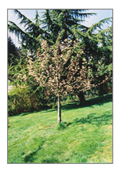
Stella Cherry in bloom

This is a deciduous tree with a more or less rounded form. Its average texture blends into the landscape, but can be balanced by one or two finer or coarser trees or shrubs for an effective composition. This plant will require occasional maintenance and upkeep, and is best pruned in late winter once the threat of extreme cold has passed. It is a good choice for attracting birds to your yard. Gardeners should be aware of the following characteristic(s) that may warrant special consideration;