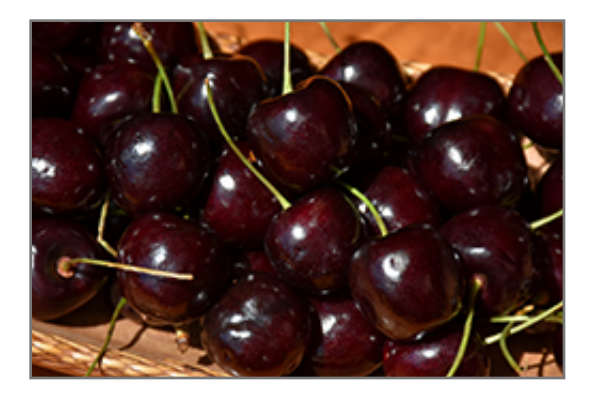
Stella Cherry fruit