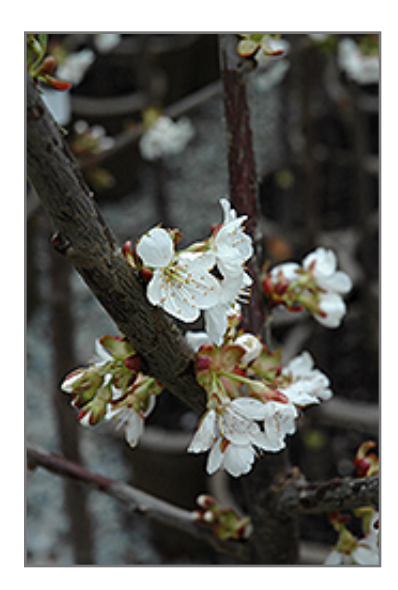
Stella Cherry flowers