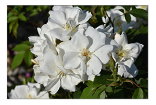
Morden Snowbeauty Rose flowers

A newer introduction which features an abundance of pretty semi-double white flowers held over glossy leaves all season long; compact mounded habit, hardy and resistant to disease, makes a dainty garden accent; needs full sun and well-drained soil