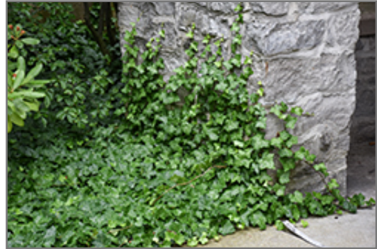
English Ivy

This plant is not reliably hardy in our region, and certain restrictions may apply; contact the store for more information.