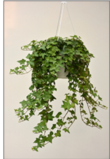
English Ivy