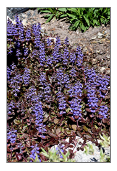
Mahogany Bugleweed flowers

This plant will require occasional maintenance and upkeep, and should not require much pruning, except when necessary, such as to remove dieback. It is a good choice for attracting butterflies to your yard, but is not particularly attractive to deer who tend to leave it alone in favor of tastier treats. Gardeners should be aware of the following characteristic(s) that may warrant special consideration;