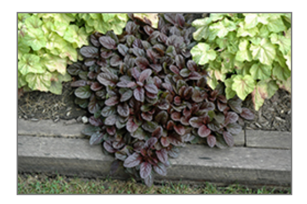
Mahogany Bugleweed