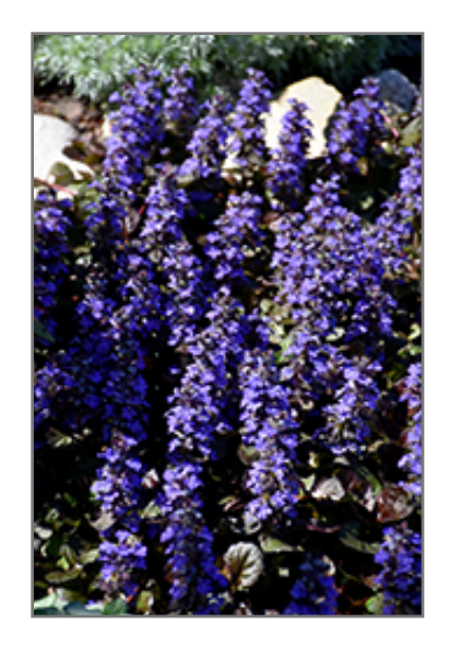
Mahogany Bugleweed flowers

This plant does best in partial shade to shade. It does best in average to evenly moist conditions, but will not tolerate standing water. It is not particular as to soil type or pH. It is somewhat tolerant of urban pollution. Consider covering it with a thick layer of mulch in winter to protect it in exposed locations or colder microclimates. This is a selected variety of a species not originally from North America. It can be propagated by division; however, as a cultivated variety, be aware that it may be subject to certain restrictions or prohibitions on propagation.