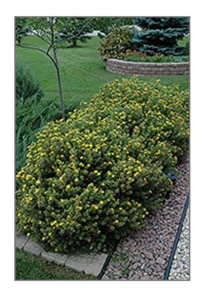
Mango Tango Potentilla in bloom