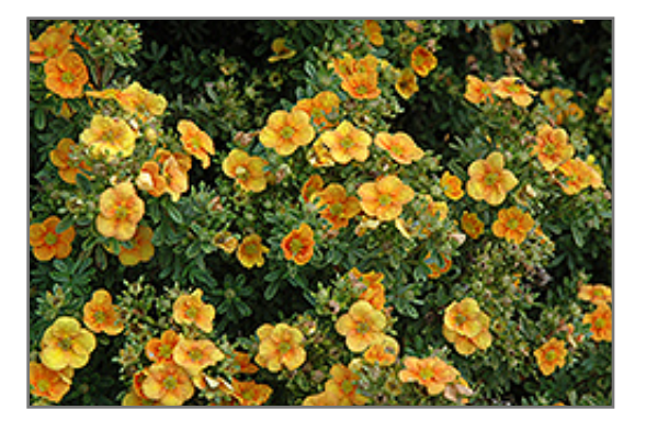
Mango Tango Potentilla flowers