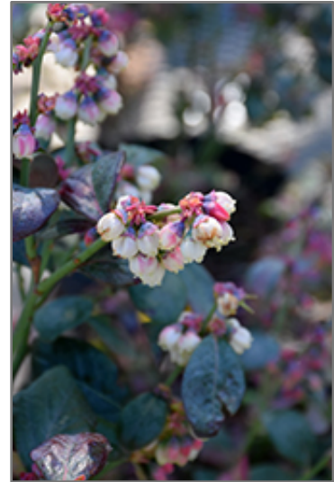
Pink Icing Blueberry flowers

This plant is not reliably hardy in our region, and certain restrictions may apply; contact the store for more information.