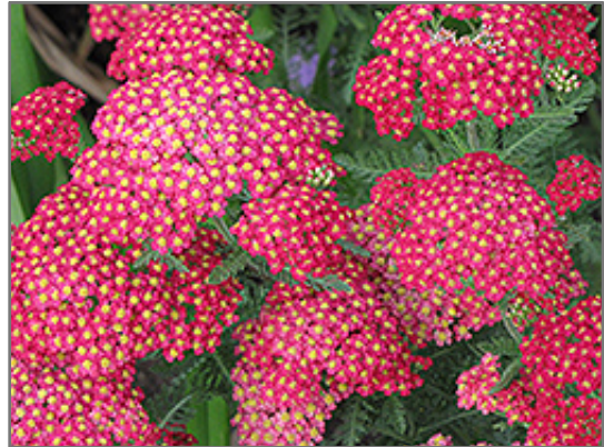
Galaxy Paprika Yarrow flowers