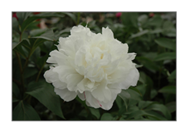
Double White Peony flowers

Large, satiny white double blooms in late spring that are richly fragrant; great for borders or mass planting; an excellent cut flower