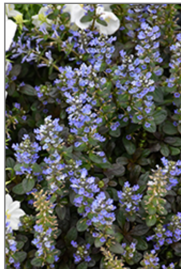
Chocolate Chip Bugleweed flowers

Chocolate Chip Bugleweed is recommended for the following landscape applications;