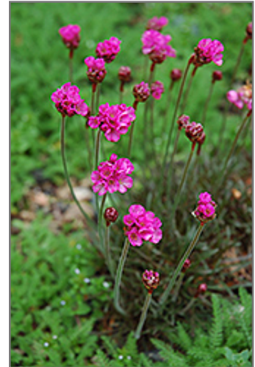
Dusseldorf Pride Sea Thrift flowers