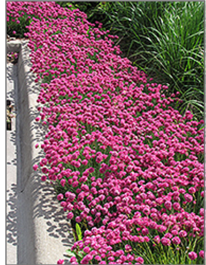
Dusseldorf Pride Sea Thrift in bloom

Dusseldorf Pride Sea Thrift is recommended for the following landscape applications;