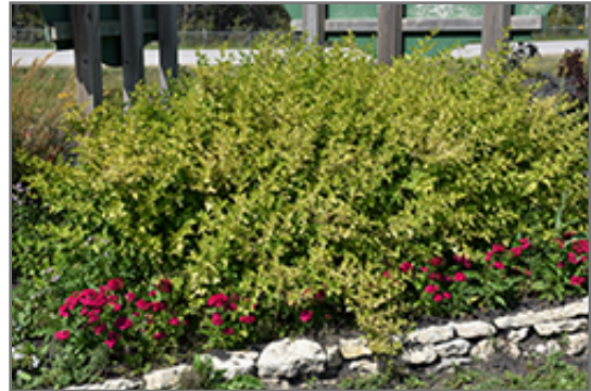
Festivus Gold Ninebark