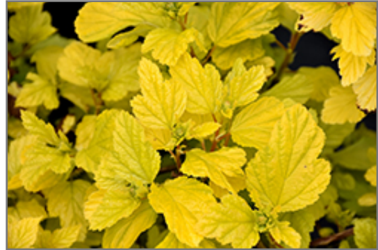
Festivus Gold Ninebark foliage

This shrub does best in full sun to partial shade. It is very adaptable to both dry and moist locations, and should do just fine under average home landscape conditions. It is not particular as to soil type or pH. It is highly tolerant of urban pollution and will even thrive in inner city environments. This is a selection of a native North American species.